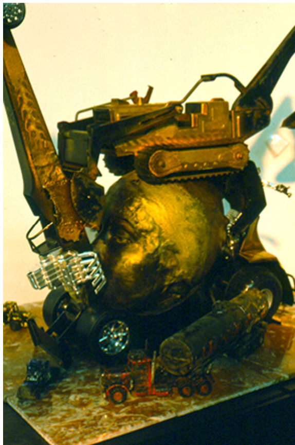
Claudia Bucher, Americana: Don't Mess My Trucks , 1990, mixed media performance-sculpture, 26" x 22" x 5'h